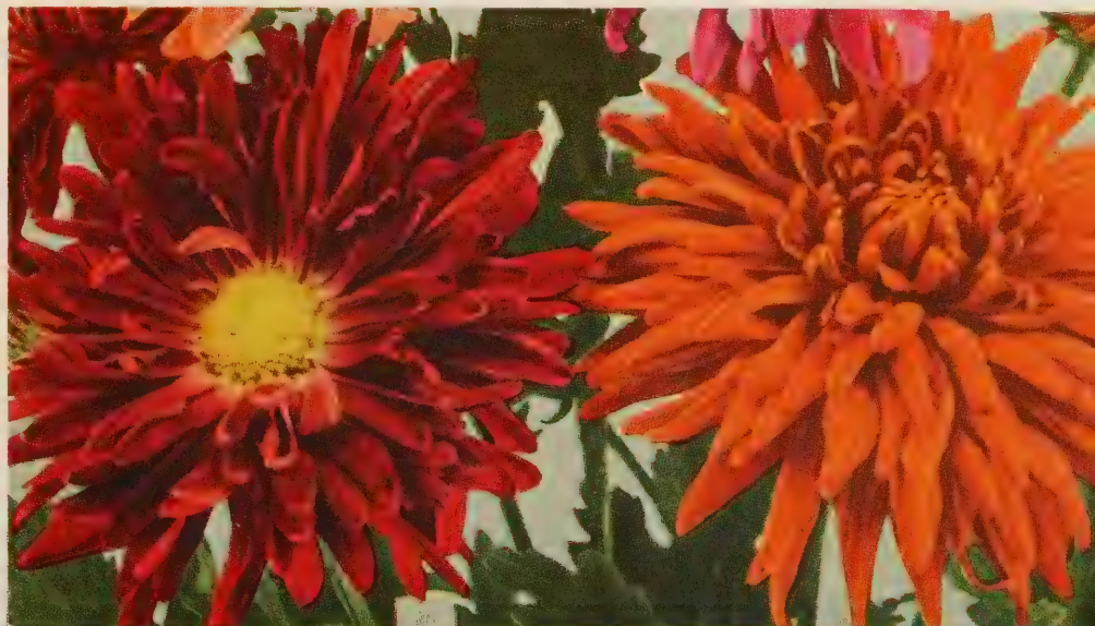
VALIANT 50c each; 3 for $1.25

One of the nicest things about our business is receiving hundreds of letters every season from happy, satisfied customers. Our plants, well established in pots, succeed everywhere.